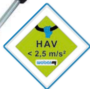
CF 2 Hd